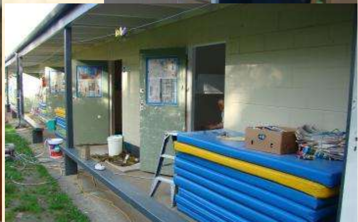
Organised chaos outside Cabins 1 - 10 spraying undercoat. As soon as the top coat is on, it's new carpet in all 15 cabins!